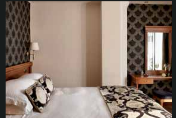
AVA Exclusive Suite